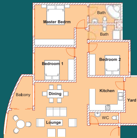
3 Bedroom (1560 SqFt)

Swimming Pool Gym & Club House High Speed Lifts Standby Generator CCTV & Electric Fence DSTV